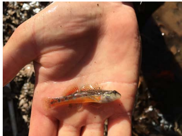
Yazoo Darter in Hand

Native Species Restoration: Continued to play a role with SARP in implementing Phase II of the Southeast Region Aquatic Organism Barrier Inventory dataset project. Phase II consists of several steps to identify high priority fish passage projects in the USFWS Region 4. Participated in calls to discuss progress and needs for the project.