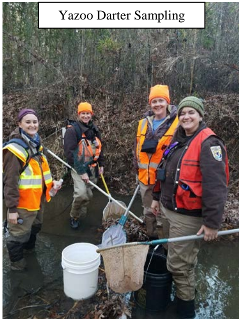
Yazoo Darter Sampling

At Risk Species Recovery: Efforts continue to be made for Yazoo Darter, a species endemic to the Yocona and Little Tallahatchie River drainages in North Mississippi. Several partners participated in Yazoo Darter sampling on Mill Creek, Moore Creek and Dickey/ Smith Creek in the Yocona River drainage in December.